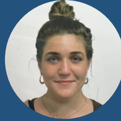
Law Enforcement Representative