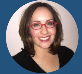
Emergency Medical Services