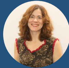
Overdose Prevention Specialist