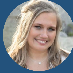
Social Worker/ Mental Health Therapist