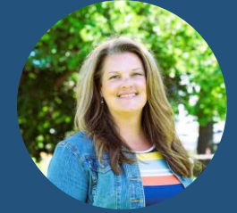
Emergency Department Nurse