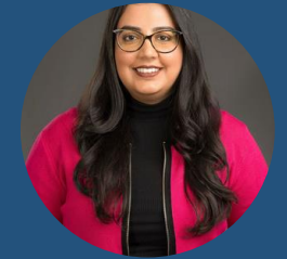
OFR Data Manager