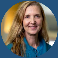
Public Health Epidemiologist