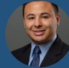
Drug Intelligence Officer (DIO)